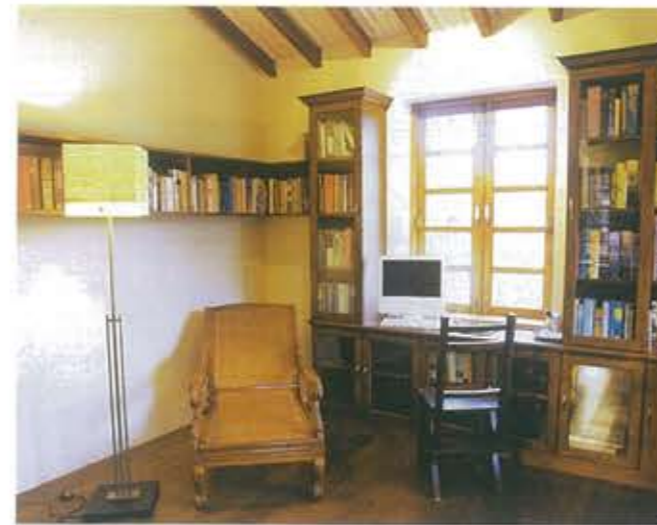
Views of the Olde Library, Residence-cum-Library, Goa